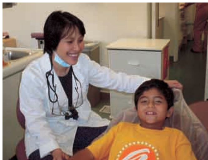
SANTA BARBARA NEIGHBORHOOD CLINICS

Please visit our website at www.huttonfoundation.org for more information about applying for a Hutton Foundation Endowment Grant.