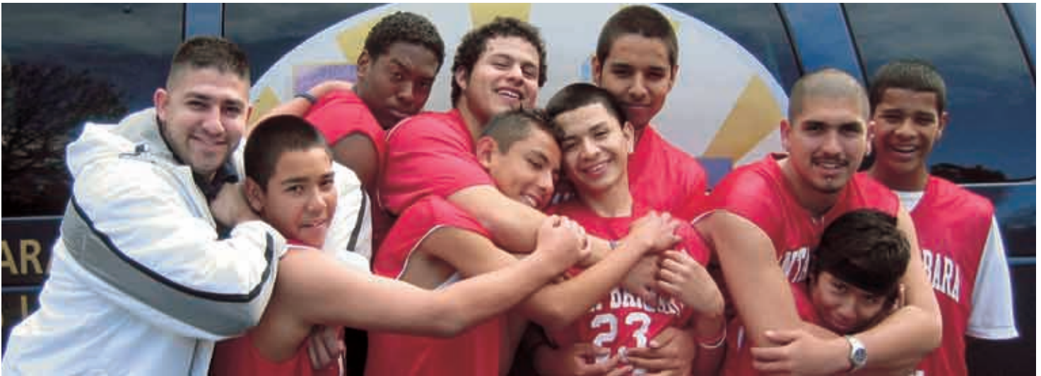
SANTA BARBARA POLICE ACTIVITIES LEAGUE