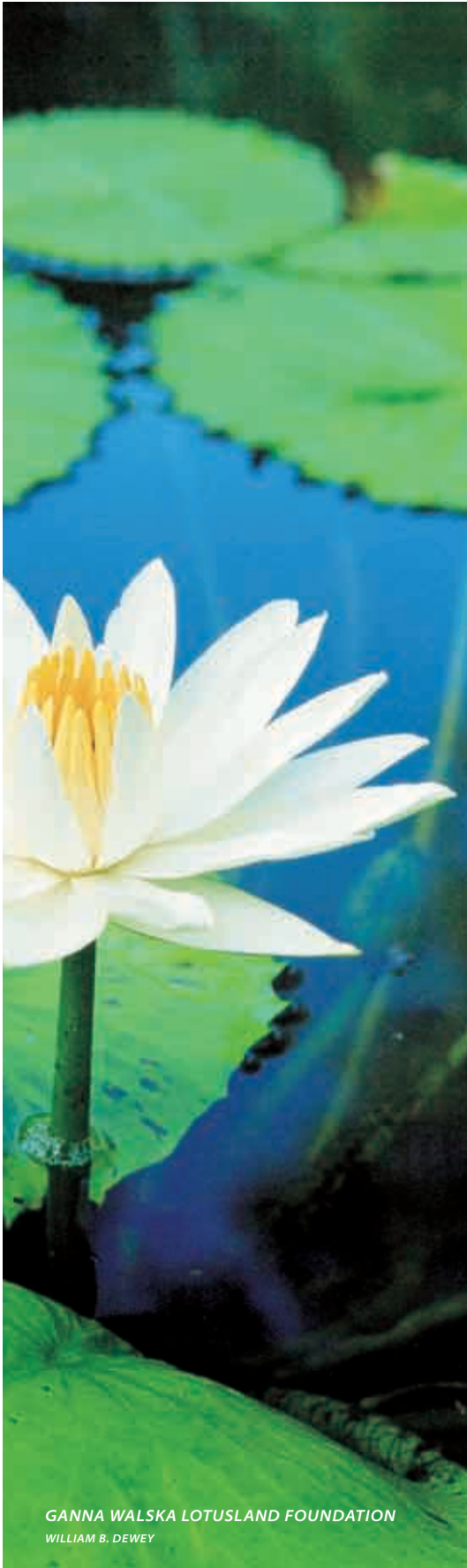
GANNA WALSKA LOTUSLAND FOUNDATION WILLIAM B. DEWEY