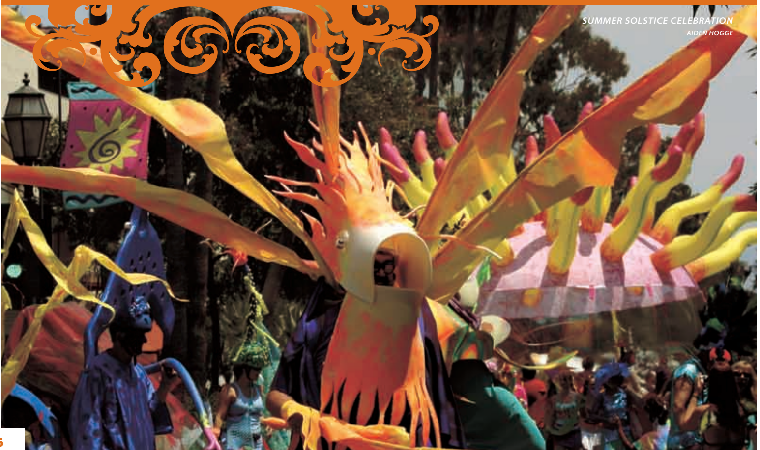
SUMMER SOLSTICE CELEBRATION AIDEN HOGGE